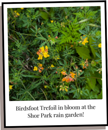
Birdsfoot Trefoil in bloom at the Shor Park rain garden!

Rain gardens are shallow depressions filled with native plants that collect and absorb stormwater runoff from impervious surfaces (where water cannot infiltrate) like roofs and driveways. Instead of sending polluted water straight into storm drains, rain gardens slow the flow, filter out contaminants, and allow the water to soak into the ground. This reduces erosion, improves water quality, and helps protect local streams (and your backyard!).