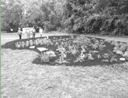
Demo Rain Garden Installed at Pattison Park

The Clermont SWCD provided technical assistance and $100 mini grants to 9 land-owners in 2008, helping them install rain gardens in their landscapes. The District will continue to offer the mini-grant program again in 2009. Contact the District office (732-7075) if you are interested in applying for a grant or need help with your rain garden.